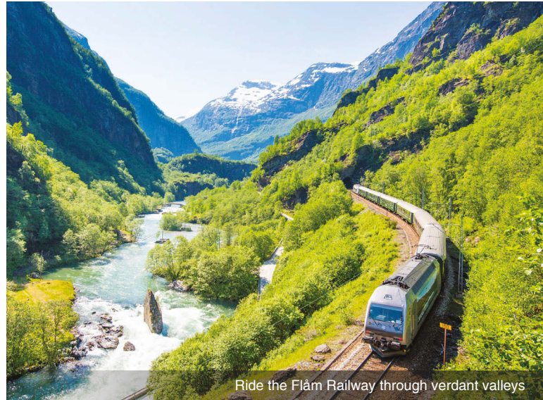
Ride the Flåm Railway through verdant valleys

DAY 1 Depart the USA: Today you'll depart the USA on your overnight flight to Stockholm, Sweden.