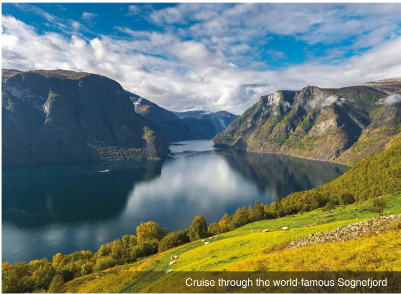
Cruise through the world-famous Sognefjord

fascinating mix of history, culture and natural beauty. A UNESCO World Heritage City, Bergen proudly preserves its rich past, seen in the timbered 15th-century houses, centuries-old warehouses built by seagoing merchants, and a charming labyrinth of cobblestone streets. Nearby, you'll visit Trolldhaugen, the former home and estate of one of Norway's most famous sons, composer Edvard Grieg. The remainder of the day is free to explore this charming city on your own. Meal: B