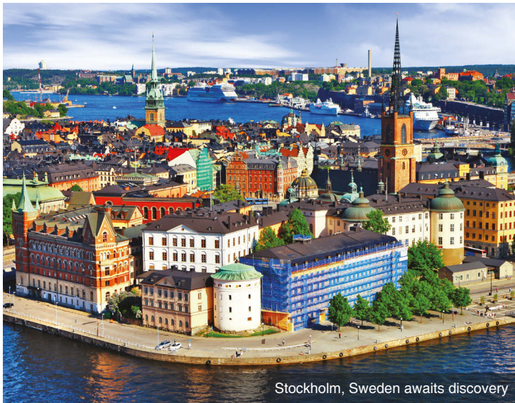
Stockholm, Sweden awaits discovery