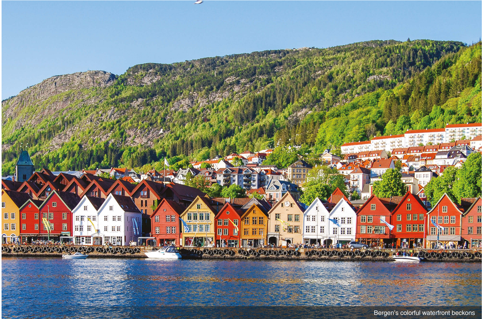
Bergen's colorful waterfront beckons